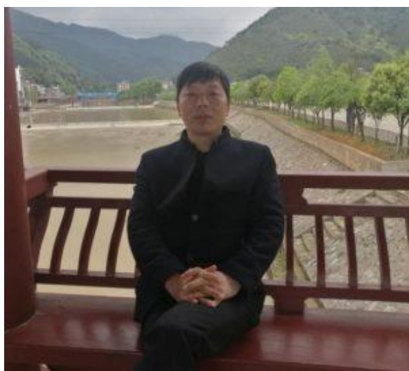
摄于蓝山县毛俊镇俊水河 Taken at Jun River in Lanshan County

The vale is door. Jesus is the door of the Kingdom of Heaven.