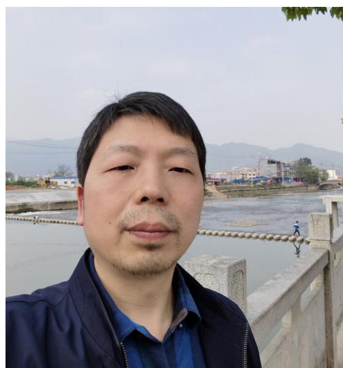
摄于蓝山县城南舜水河 Taken at Shun River in Lanshan County