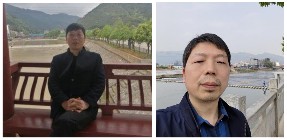
摄于蓝山县毛俊镇俊水河 Taken at Jun River in Lanshan County

The vale is door. Jesus is the door of the Kingdom of Heaven.