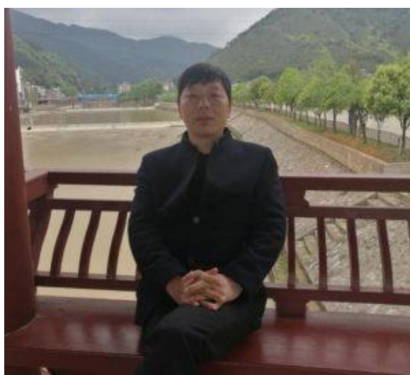
摄于蓝山县毛俊镇俊水河 Taken at Jun River in Lanshan County

The vale is door. Jesus is the door of the Kingdom of Heaven.